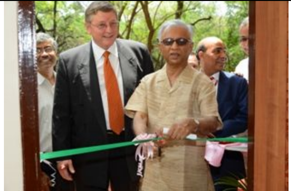
Demonstration Building for Rapid Affordable Mass Housing using Glass Fibre Reinforced Gypsum Panels at IIT Madras